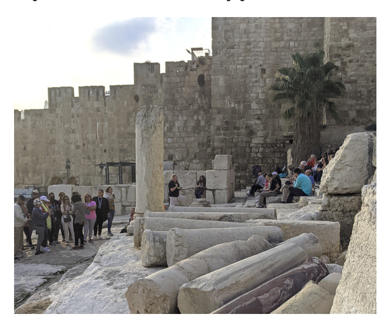
Day 9 - Return to the USA or Enjoy an Extension.

This morning, enjoy a walking tour of the Old City of Jerusalem along the Cardo, once the main street of the city. Remember how Jesus healed on the Sabbath when you visit the Pool of Bethesda (John 5: 1-18). At Herod's Antonia Fortress (Luke 23:1), see where Jesus was brought before Pontius Pilate. Walk the Via Dolorosa ("the Way of the Cross") and remember the Lord's sacrificial love at the Church of the Holy Sepulchre. Share communion together at the Garden Tomb in celebration of His Resurrection. Enjoy a free afternoon to explore Jerusalem.